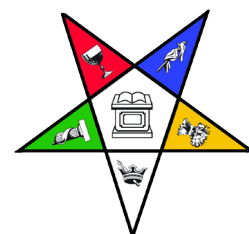
Order of Easter Star